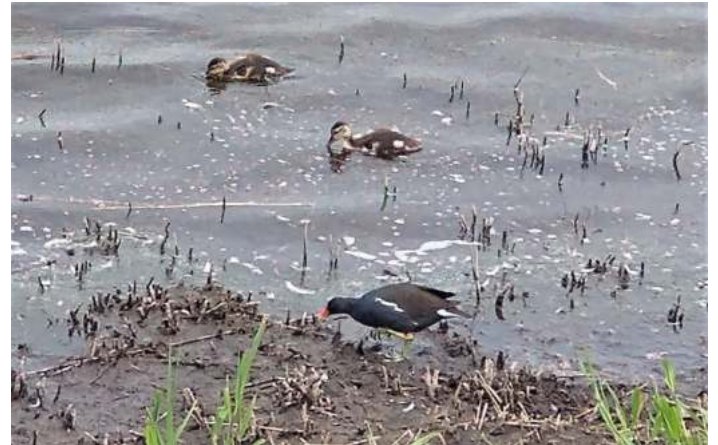
Below the hide was a moorhen and garganey ducklings.

talons. She then then landed on a small bush/ tree where she proceeded to pull the prey apart with her beak. We don't know if they had a nest nearby but it seems likely. They nest on the ground amongst the reeds.