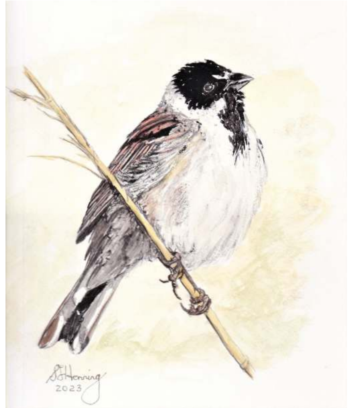
The male reed bunting usually sings perched on top of a bush, or reed (del. S.F. Henning).