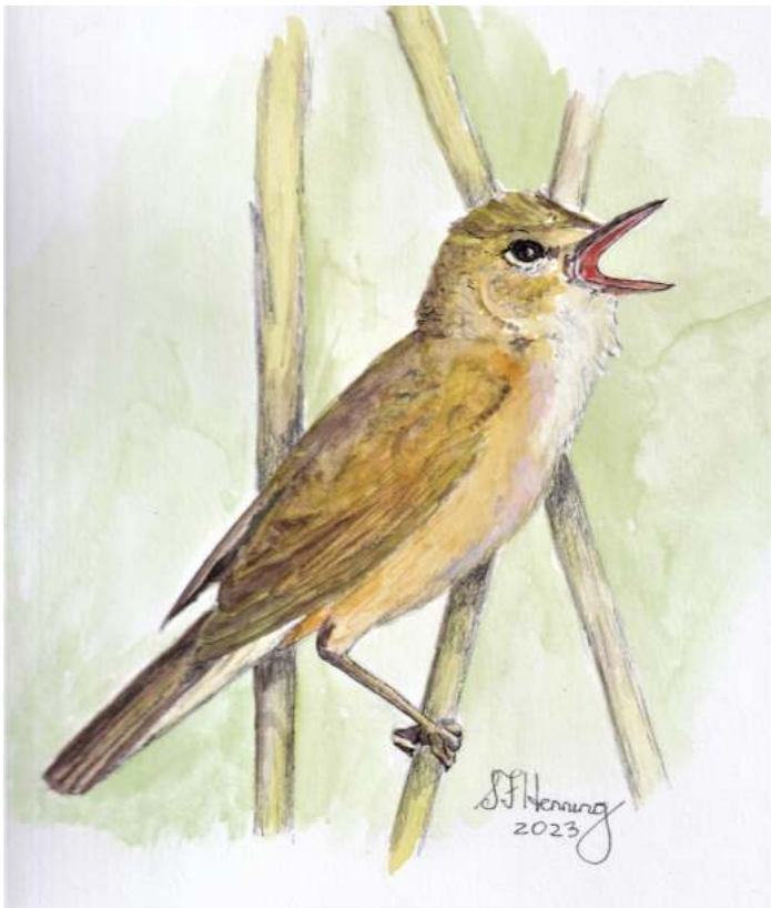
We had a wonderful sighting of a reed warbler singing its little head off in the reeds (del. S.F. Henning).

A bit further along we had a good sighting of a male reed bunting singing next to the path in the reeds. They can be found in wetlands, reedbeds and on farmland across the UK. They in fact occur in wetlands and reedbeds near us in Wiltshire. They feed on seeds, insects, and other invertebrates. In the winter, reed buntings join mixed flocks of buntings, finches, and sparrows to feed on seeds on farmland. During the breeding season, males can be spotted perched high on reeds, rushes, or scrub, voicing their simple, three-note territorial call. Females breed low in dense vegetation, and construct their nests from grass, reeds, and moss.