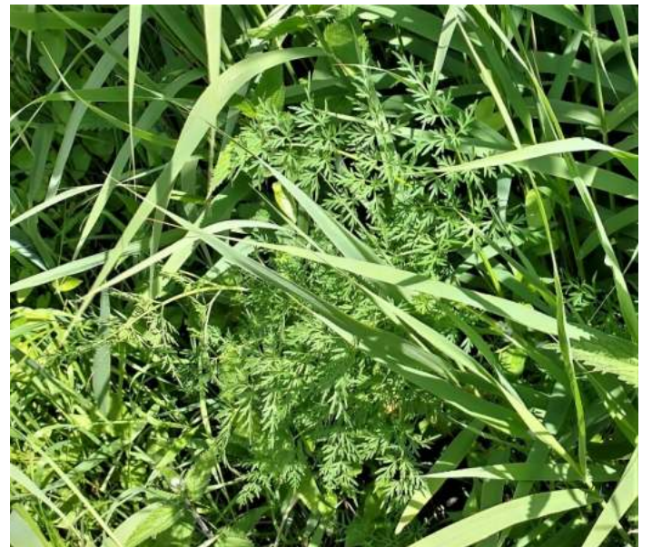
Milk parsley ( Peucedanum palustre ) the larval foodplant of the swallowtail among the reeds.

We then stopped at the Tower Hide where we saw a lone graylag goose and a moorhen walking along the edge of the water with his long yellow toes. There was also a garganey duck with ducklings just below the hide.