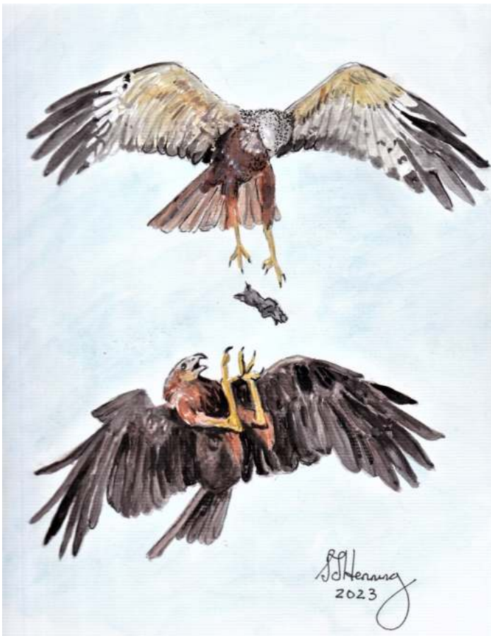
The male marsh harrier dropped the prey for his mate, and she caught it in mid-air with her talons

There was also a pair of marsh harriers flying around. I think they also had a nest. We saw the male swoop down into the reeds and catch a small mammal in his talons. Then as he flew up, the female also rose up from the ground and flew up towards him. He then dropped the prey for her, and she caught it in mid-air with her