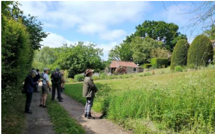
Waiting to see a swallowtail butterfly outside the doctor's house at Strumpshaw Fen with some of the other fanatics.

On our way again we saw a skein of Canada geese flying over us in a perfect V-formation. We saw posters about the swallowtail butterfly but saw none of them flying about the reeds. We found their foodplant, milk parsley, along the edge of the boardwalk in the reedbed. Milk parsley is only found in the Broads