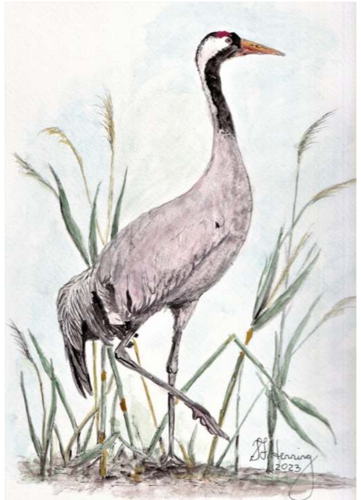
We saw a European crane from a hide at the RSPB Strumpshaw Fen (del. S.F. Henning)

After a while we returned to the path on the inside of the dunes and walked along to as far as the public carpark. On the way we were treated to the sight of skylarks spiralling up into