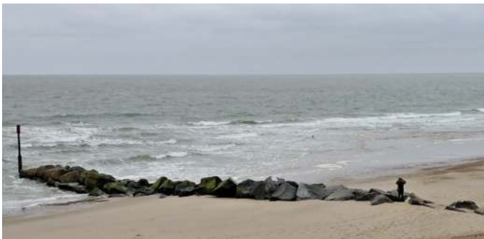
Watching the seals in the waves from one of the rocky groins

The beach was broad and sandy with rocky groins every 100 metres or so to protect the beach from sand loss. There were no seals on the beach, but a number could be seen swimming in the waves crashing onto the beach. Mercedes called to me that she could see lots of seals in the sea from the top of the dunes. I then climbed up and joined her.