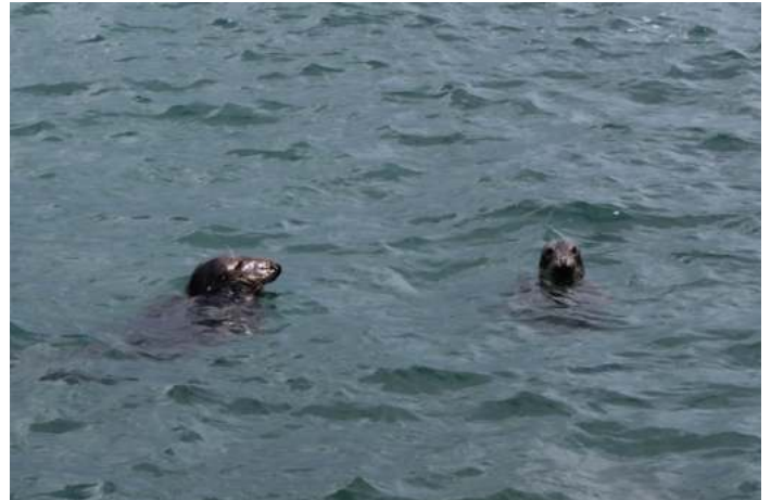
We could see a lot of seals in the sea and surfing the waves.

After a while we returned to the path on the inside of the dunes and walked along to as far as the public carpark. On the way we were treated to the sight of skylarks spiralling up into