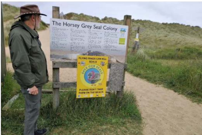
Reading the sign about the Horsey Grey Seal Colony

We eventually got to the dunes separating the fenlands from the beach and sea. According to the notice board, both species of seal that live in the UK can be seen on the beach at Horsey. Common seals, despite their name, are fewer in numbers than the larger grey seals and are more often seen outside the grey seal pupping season. The grey seals give birth to their pups on the beach between October and March. I walked through the gap cut through the dunes onto the beach while Mercedes made her way to the top of the dunes.